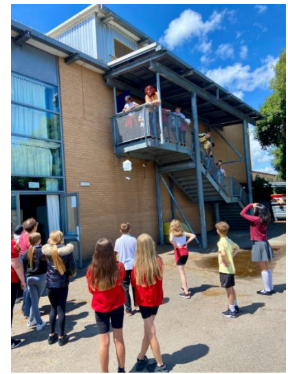
Redbridge Community School @RedbridgeCS Other activities on Transition Day today included decorating plant pots and planting wildflower seeds to take home, and taking part in a Shape Search to identify different shapes out and around the school. We have been so impressed by the students today - well done! #Respect