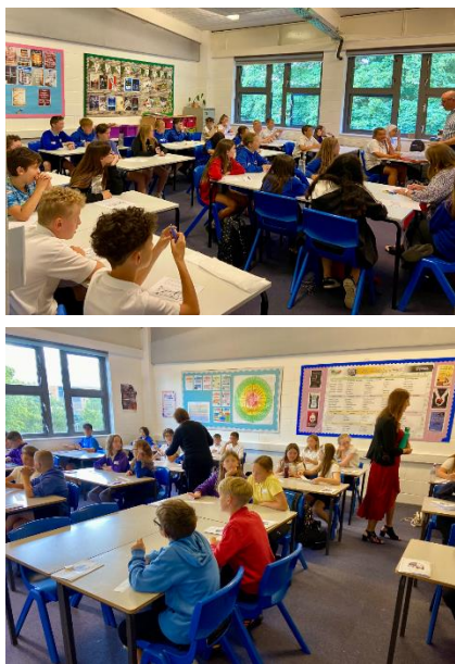
Redbridge Community School @RedbridgeCS - Jul 5 Here are some of the Year 6 students taking part in the Parachute Challenge. Pupils worked in groups of 3 to create a parachute with only a few pieces of equipment and then tested their craft using an egg as their passenger. Needless to say they had a "cracking" time. #Aspiration